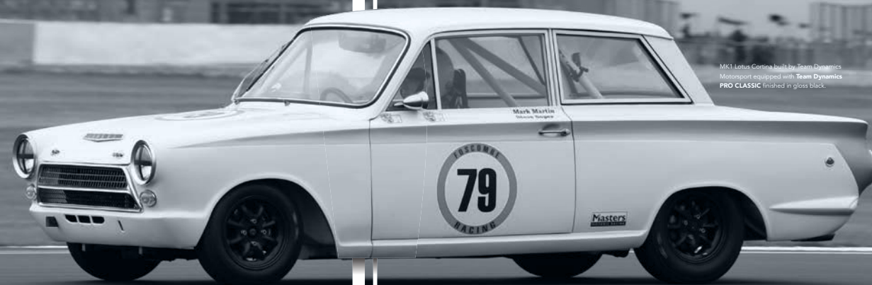
MK1 Lotus Cortina built by Team Dynamics Motorsport equipped with Team Dynamics PRO CLASSIC finished in gloss black.