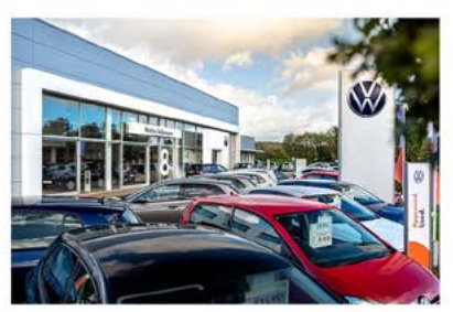
A family run business with elegant touches from some of the biggest and best car brands on the market. Every visit to our Martins Group franchises is a pleasurable experience.