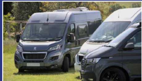
AUTO · EXPLORE