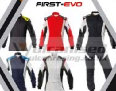
FIRST-EVO RACE SUIT FIA 8856