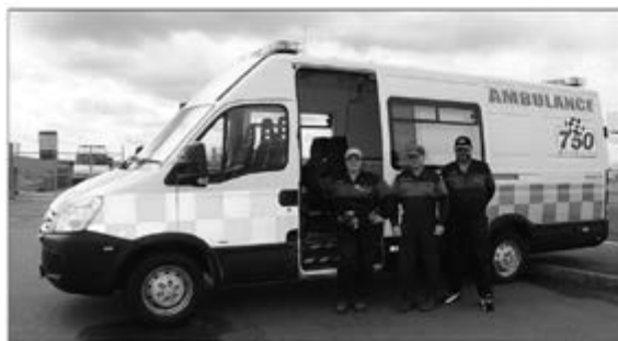
The Race Rescue Unit is one of the many Marshaling opportunities available