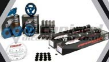
KK1 VVC Delorte Hydraulic