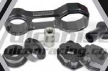
SEARTH 300/305/308 2007 ONWARDS WEB TORQUE ADJUST TRACK USE RFX18-01