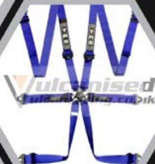
21EG282 INTERNATIONAL QUICK