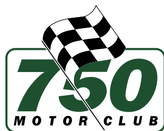
The Race Rescue Unit is one of the many Marshaling opportunities available