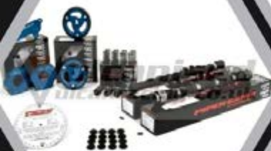
RX3 VVC Delete Hydraulic