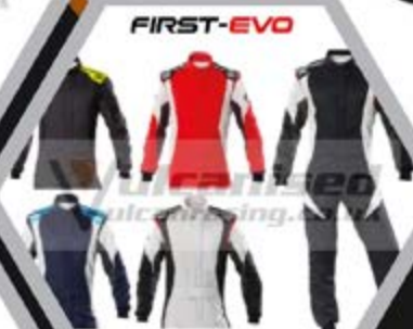
OMP FIRST EVO RACE SUIT FIA 8856