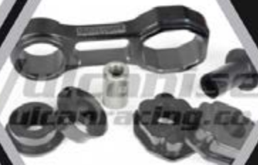
SIMPSON 300/305/305 2807 ONWARDS POWER TORQUE MOUNT TRACK USE RFFS & ST