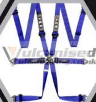
2165282 INTERNATIONAL QUICK