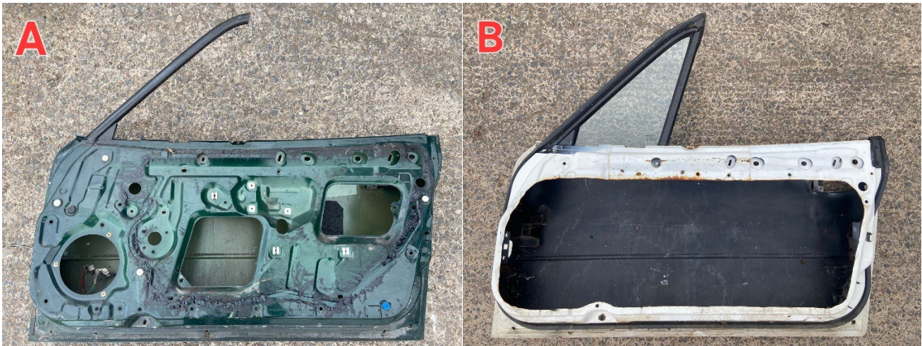
5.6.1.2: Picture A shows a standard door, and B a correctly modified door retaining the upper door frame.