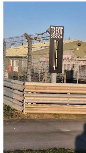
Sign at Turn 3 Exit