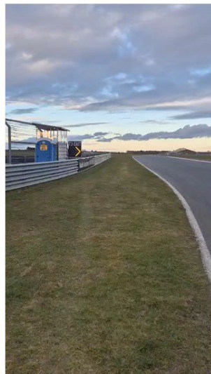
Sign on inside of Turn 3