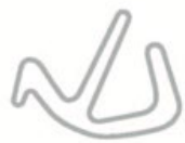
international gp 2.10 Miles